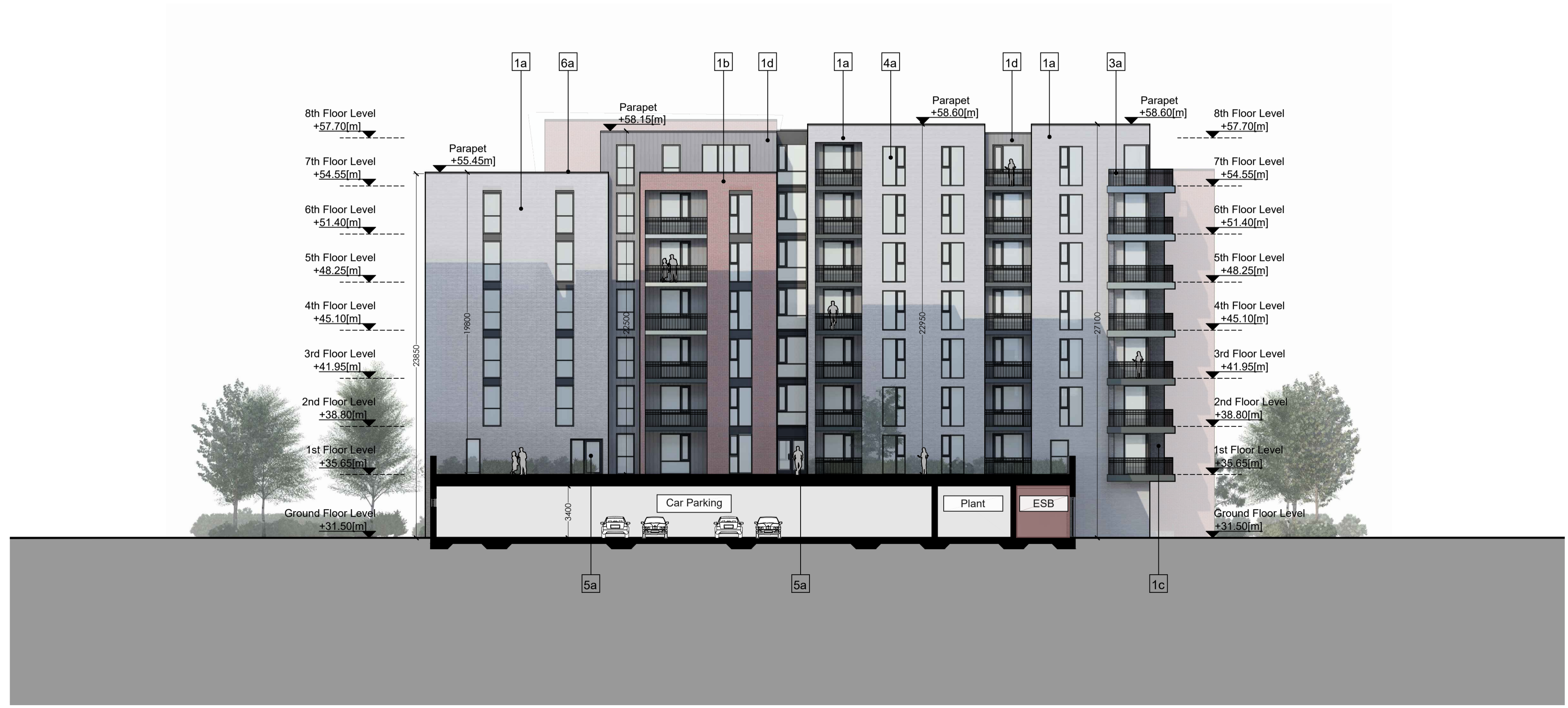
Courtyard West Elevation - Block 2 Scale 1:200 @A1

WILSON ARCHITECTURE OMM | W St Patrick's Place, Wellington Rd., Cork t: 353-21-455255 e: info@wilsonarchitecture.ie 36 Pembroke Rd, Dublin 4 t: 353-1-6601866 w: www.wilsonarchitecture.ie